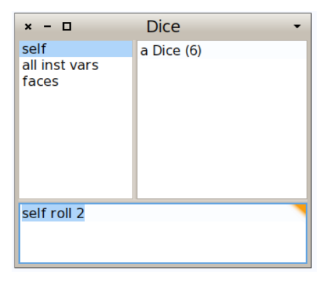
Figure 1.3: Dice details.