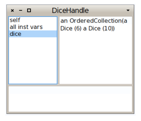
Figure 1.4: Dice Handle with more information.