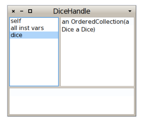
Figure 1.2: Inspecting a Dice.

Finally we should add the method diceNumber to the DiceHandle class to be able to get the number of dice of the handle. We just returns the size of the dices collection.