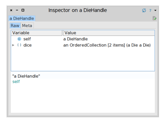
Figure 1.4 Inspecting a DieHandle.